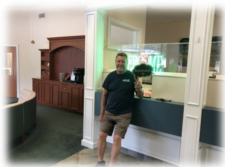
(Tewksbury—910 Andover Street)