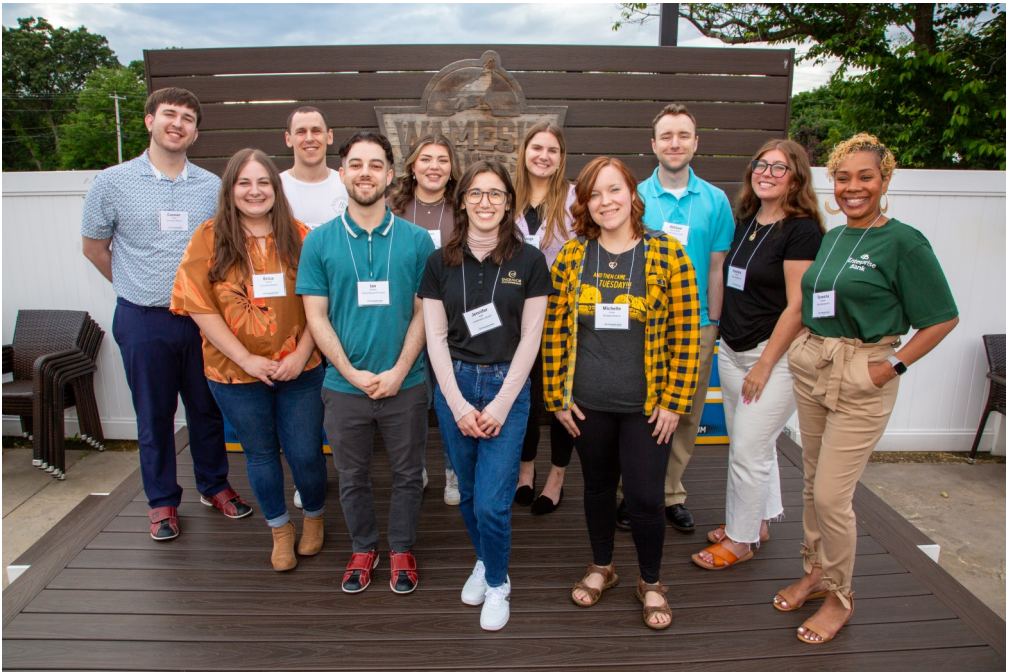
(Some of our Young Professional Resource Group (YPRG) team members at the Enterprise Bank event at Wamesit Lanes in Tewksbury.)